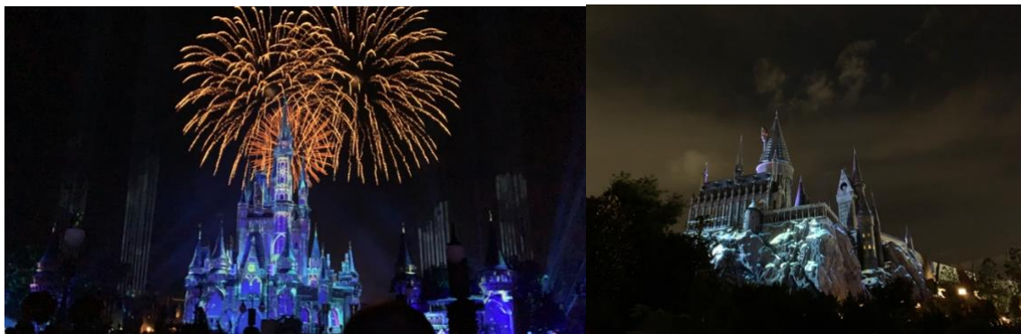
Orlando, Florida, USA