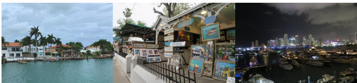
Miami & Key West, Florida, USA