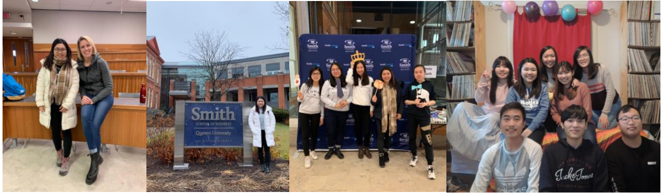
Queen's University, Kingston, Ontario

We attended a farewell event for exchange student organized by the faculty. I had a week's time before the final examination began. I spent most of the days doing revision and working on the capstone presentation with my teammates. We also had fun playing in the snow at the front yard of our residence! I had all my exams finished on 16 th December and this was when my adventure began! I visited Toronto, Orlando, Miami, Key West, Cuba and Mexico with other exchange students, marking the end to my life as an exchange student.