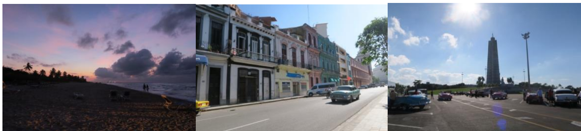
Varadero & Havana, Cub